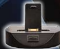
MZ-Dock INCLUDES MZ-iPORT, 5VDC PSU, 6' CAT5 CABLE.