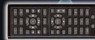
R-2 REMOTE CONTROL